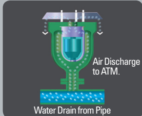
Activation 1 Pressure Relief